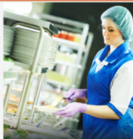
Hospitality and Food Service