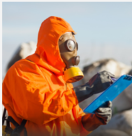
Municipal Worker Safety